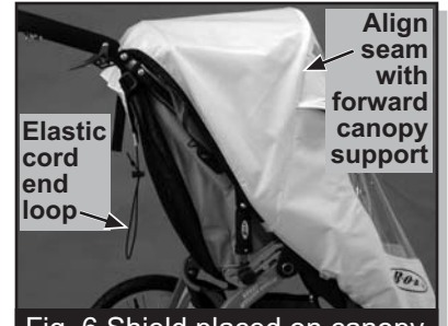
Fig. 6 Shield placed on canopy